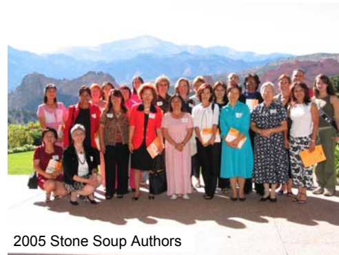
2005 Stone Soup Authors

Recipes, thoughts, letters, poems, experiences, stories... all genres are welcome. Authors may