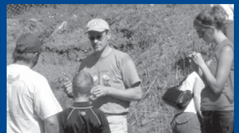
Cool Science participants get ready for a rocket launch at Ute Pass Branch.