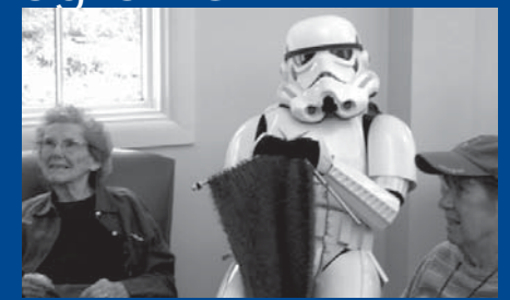
Stormtrooper seriously considers a new hobby.

A lively group of young patrons enjoyed the Stormtrooper and Darth Vader visit to Ute Pass Branch in late September. Amid light sabers aglow and the sound of marching Troopers, the "rocket's red glare" could be seen from library windows as members of the group Cool Science fired off small rockets from the back parking area.